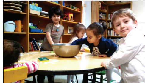
Spring Cleaning with Little Ones

If you need to order a name tag, contact the church office at 206-523-3040 or spcommunity@qwestoffice.net .