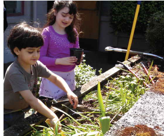
Preparing for the new Planter